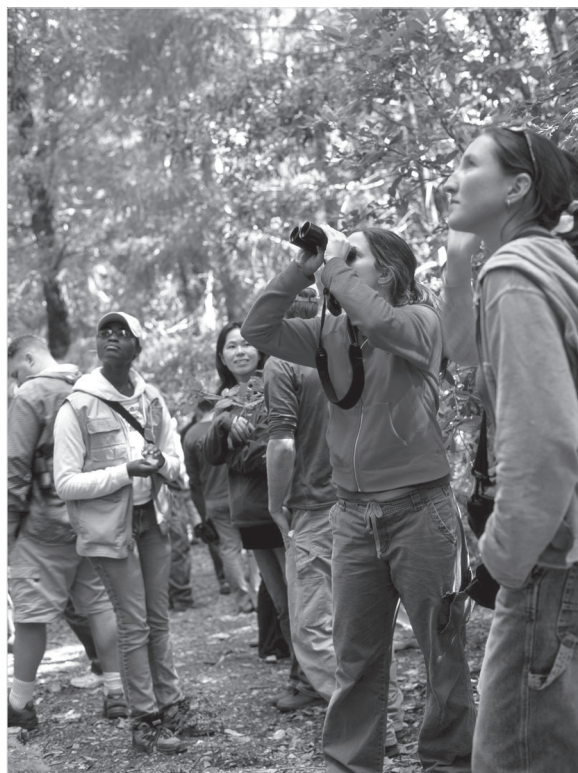
class field trip