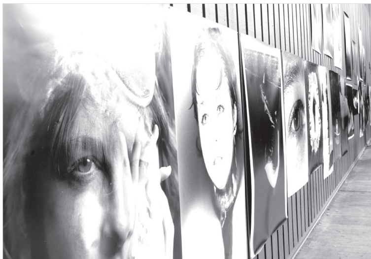
student photo display

Humboldt enrolls about 7,500 students each year. The average student's home is more than 500 miles from campus. Despite its size and remoteness—possibly because of them—Humboldt State is known for academic excellence, evidenced by high postgraduate and professional test scores. Though the atmosphere and lifestyle are casual, faculty take seriously their personal commitment to helping students advance along a rigorous scholarly trail.